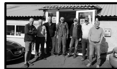
UCKFIELD MEN'S SHED